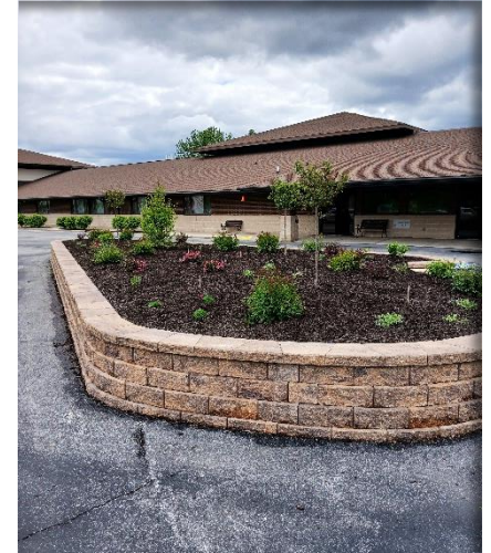
May 22, 2025