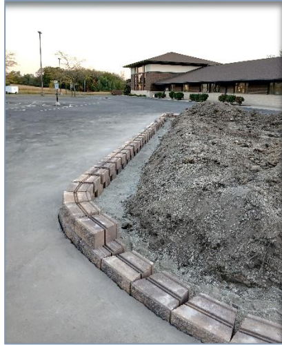
October 3, 2024