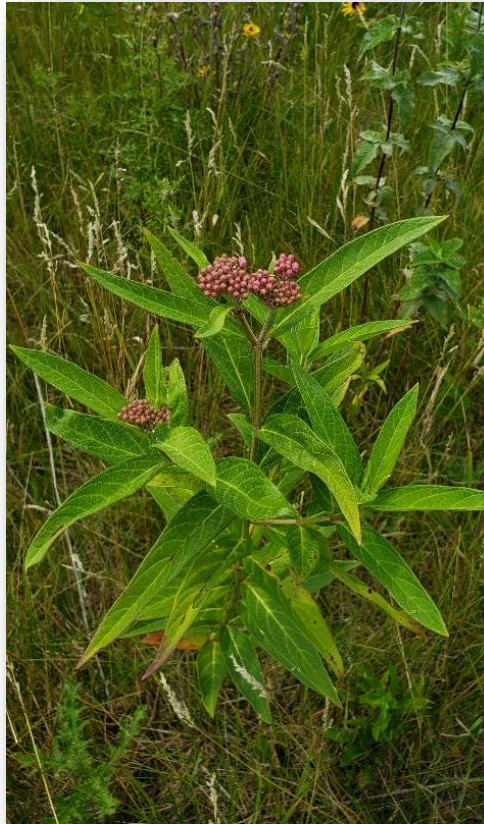
Jan Sanders Butterfly Garden Swamp Milkweed in Bloom